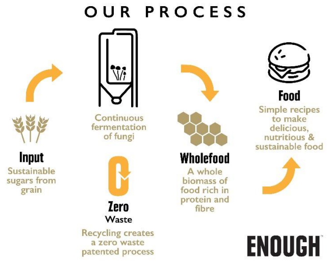
Simplified Process to make ABUNDA with zero-waste

ENOUGH opened our first-of-its-kind protein factory in 2022, located in the Netherlands, with initial capacity to grow 10,000 tonnes per annum and with plans to double this in 2025. The company targets producing over a million tonnes cumulatively by 2033.